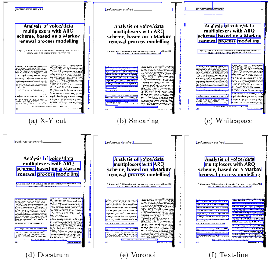
Fig. 2. Segmentation results from applying each algorithm to one page image. The page contains a title in large font and a big noise strip along the right border. (a) The X-Y cut algorithm fails in the presence of noise and tends to take the whole page as one segment. (b) The smearing algorithm also classifies the detected regions as text/non-text, and thus misses the lines joined by the noise bar. (c),(d),(e) Due to the large font size and big inter-word spacing, the Voronoi, Docstrum, and whitespace algorithms split the title lines. (f) Due to the noise bar, several characters on the right side of each line in the second column were merged with the noise bar and the text-line finding algorithm did not include these characters.

tive of the majority of scanned documents that are captured today. In summary, although the diversity of layouts found in the UW-III database is good, we consider the variability of physical properties like resolution and image degradation to be too limited for a good evaluation; and we therefore need to test the robustness of algorithms using more heterogeneous document collections. It would be an important step to make available a larger, ground-truthed database with more variability for future research.